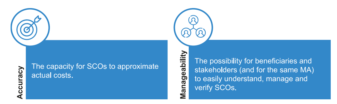
Figure 7 – Trade-off between accuracy and manageability

Some MAs (particularly the less experienced) tend to design complicated SCO systems, including multiple amounts or rates, in an attempt to maximise the accuracy of results. Nevertheless, experience shows that manageability is as important as accuracy. Complex SCO structures could limit or even nullify the advantages of the simplification measure by increasing the administrative burden and risk of error for both authorities and beneficiaries.